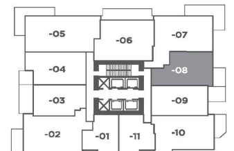
7TH - 40TH FLOOR